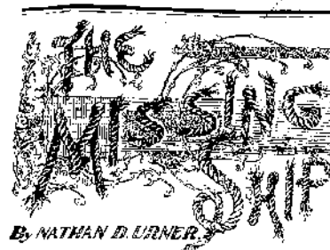
By NATHAN D. LERNER

And just to that extent the strength of the nation is in danger of being weakened. Why Government? Indeed, in the general course for which the government is held responsible, it is not the government that is the cause of the trouble, but the people who are in charge of it. The government is a mere instrumentality, and its actions are determined by the will of the people who elect it. If the people are wise, the government will be wise; if the people are foolish, the government will be foolish. The government is not the cause of the trouble, but the people who are in charge of it. The government is a mere instrumentality, and its actions are determined by the will of the people who elect it. If the people are wise, the government will be wise; if the people are foolish, the government will be foolish.