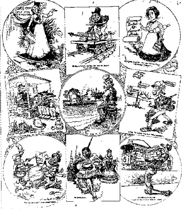
WOOD IS ITS TRUE COLORS